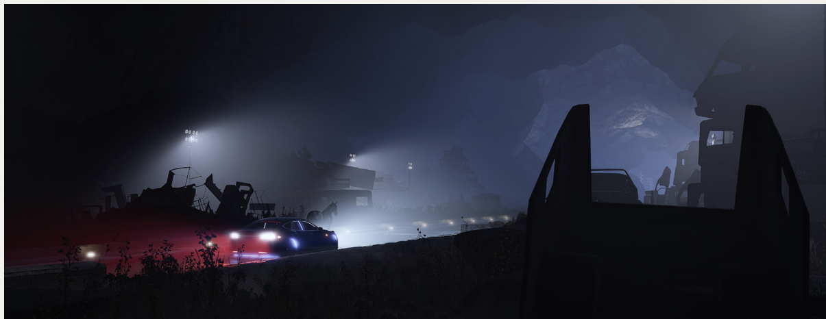
Lawrence Lek, NOX - 'Day Five: Equine Therapy', 2023. Video Still. Commissioned by LAS Art Foundation, Berlin.